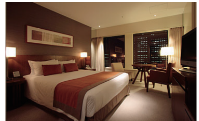
Keio Plaza Hotel

Accommodations are not included but can be arranged at Keio Plaza Hotel in Shinjuku area, with special rate. All additional hotel expenses such as laundry, telephone, private meals will be at the expenses of each participant. Travel to and from Japan will be at the expense of each participant.